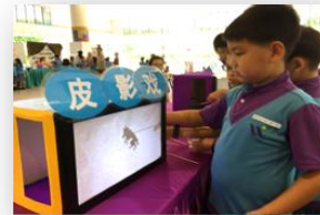
CL: Tea Appreciation