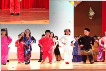
Hari Raya Puasa