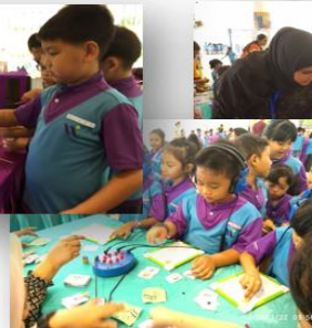
ML: Traditional Art & Craft (Batik & Anyaman)