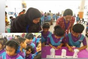
TL: Speech & Drama (Hand Puppets); Mask making